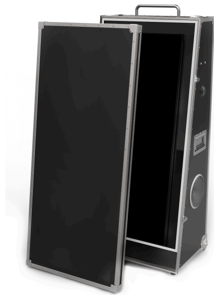
Dimension of Mirror Booth (mm): 560 (L) X 470 (W) X 1370 (H)